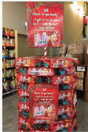
Mariano's Chicago, IL