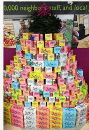
Food Front Portland, OR