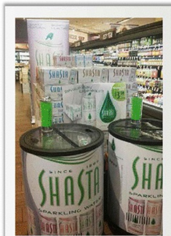
Bristol Farms Los Angeles, CA